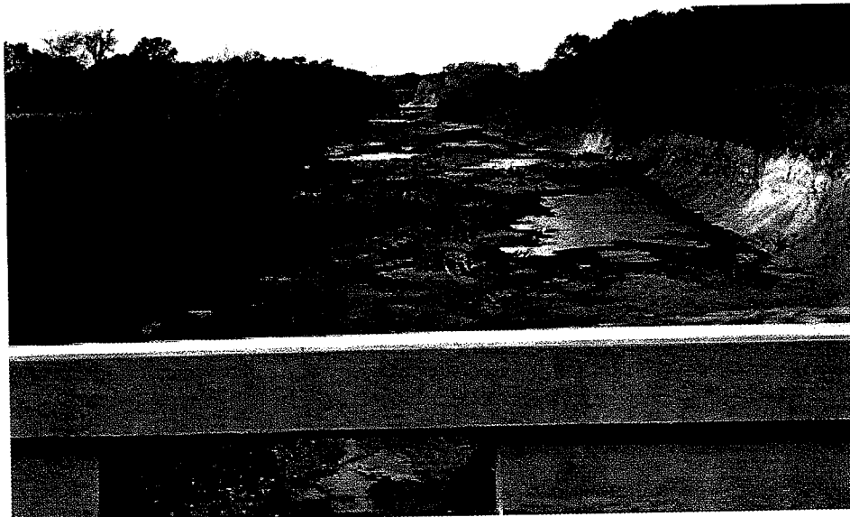
Looking up the river channel from the Hwy. 34 bridge.

While the project was originally declared a success -- this became one of the only rivers in the U.S. that never leaves its banks -- two important facts were overlooked. First, although a flood could devastate a crop, it also brought silt and nutrients to naturally replenish the soil. Secondly, thousands of acres were destined to disappear as that 16x10 channel eroded into what is now a 300-foot wide, 60-foot deep channel that is twice as wide as the Panama Canal.