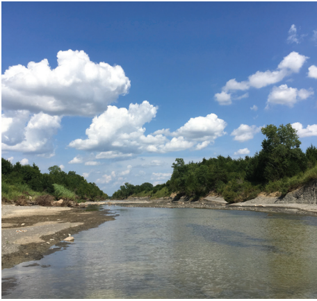
Lake Ralph Hall will reduce the effects of severe erosion on the North Sulphur River channel (now over 300 feet wide).